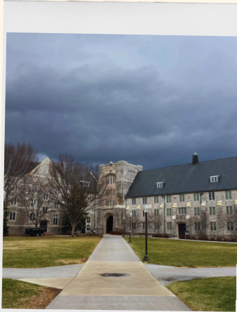
Virginia Tech University