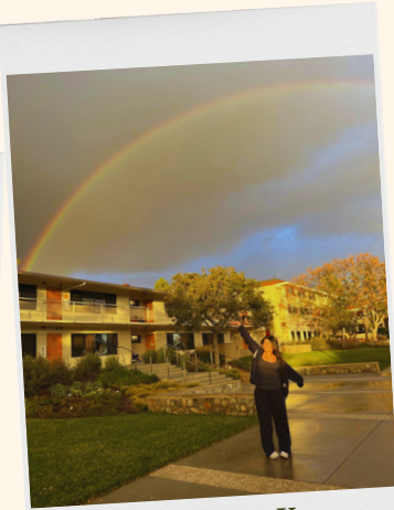
Claremont McKenna College