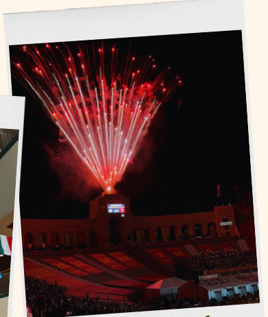
University of Southern California