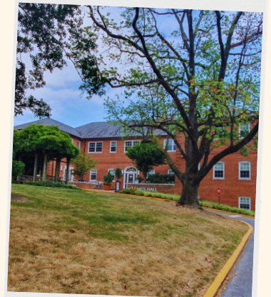
George Washington University