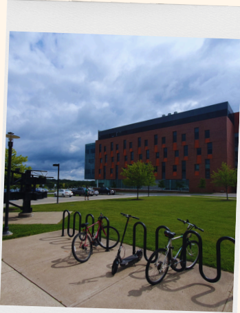
Rochester Institute of Technology

We are excited to share snippets from the college journeys of our previous cohorts!